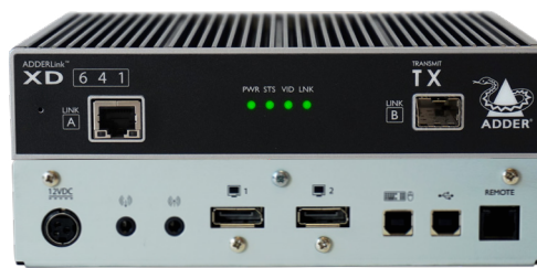
ADDERLink XD641 TX - Front & Rear