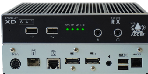
ADDERLink XD641 RX - Front & Rear

CAT6 is recommended for CATx extensions. CATx extensions are limited to 2 patch connections. Patch cables should be CAT6 or better.