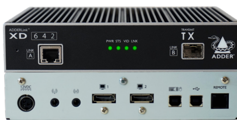
ADDERLink XD642 TX - Front & Rear