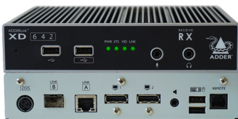
ADDERLink XD642 RX - Front & Rear

CAT6 is recommended for CATx extensions. CATx extensions are limited to 2 short patch connections. Patch cables should be CAT6 or better.