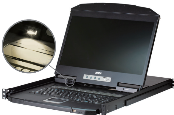
CL3116 Front view