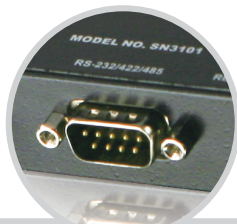
RS-232/422/485 3-in-1 serial Port